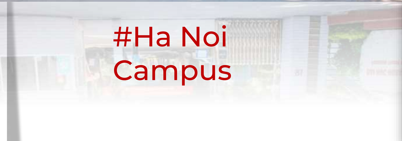
#Ha Noi Campus