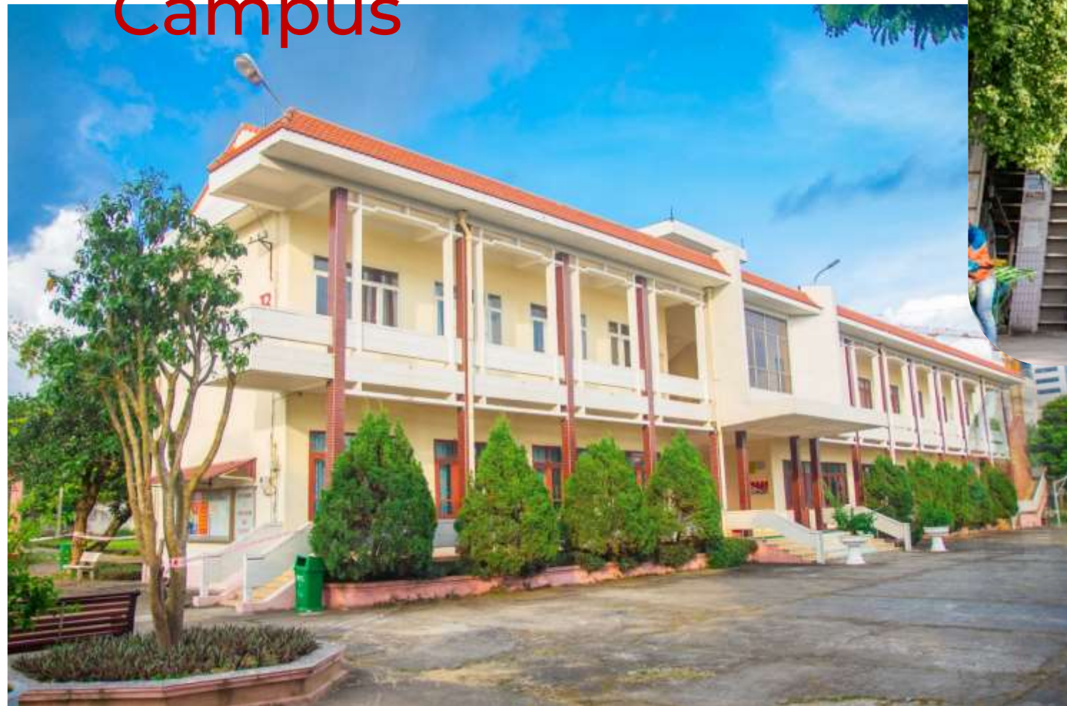
#Quang Ninh Campus